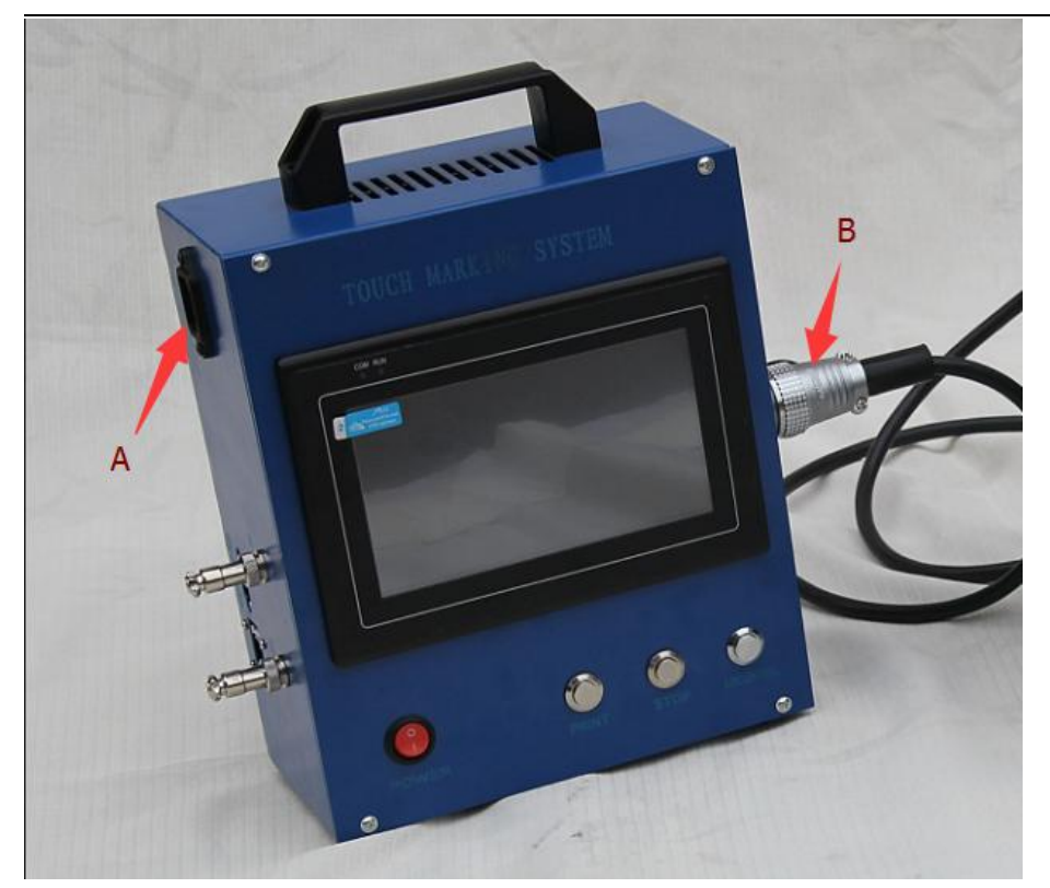
A: controller power line interface (need to ground wire, otherwise long term use will cause harm to display)